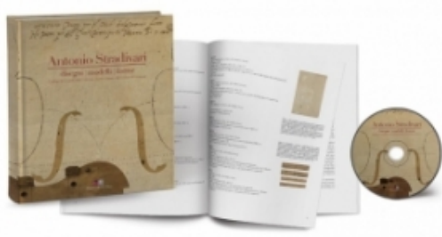
Caralogue "Antonio Stradivari" disegni, modelli, forme