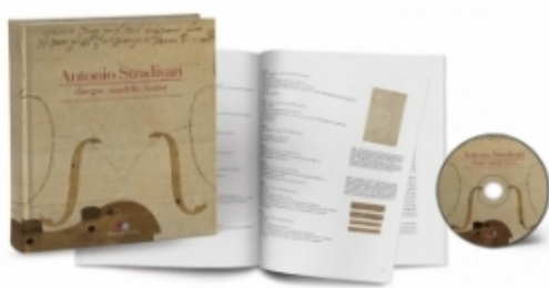
Caralogue "Antonio Stradivari" disegni, modelli, forme