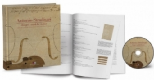
Caralogue "Antonio Stradivari" disegni, modelli, forme