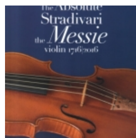
Caralogue "Antonio Stradivari The Messie- Violin 1716/2016"