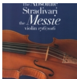
Caralogue "Antonio Stradivari The Messie- Violin 1716/2016"